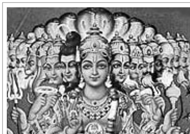
Indian Pantheon of gods

that the world may believe that thou hast sent me. And the glory which thou gavest me I have given them; that they may be one, even as we are one: I in them, and thou in me, that they may be made perfect in one; and that the world may know that thou hast sent me, and hast loved them, as thou hast loved me." Jochanan 17:20-23